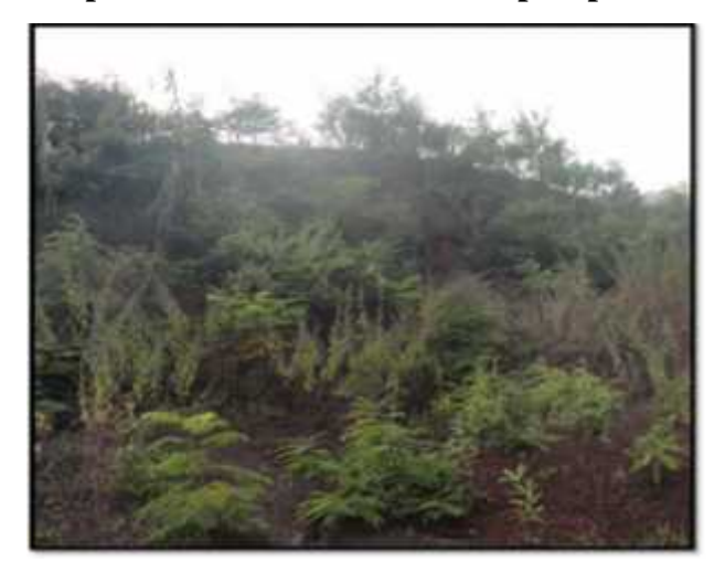
Photo 4A & 4B - Shows Green Coverage on Dumps with application of coir mat & grass seed applications