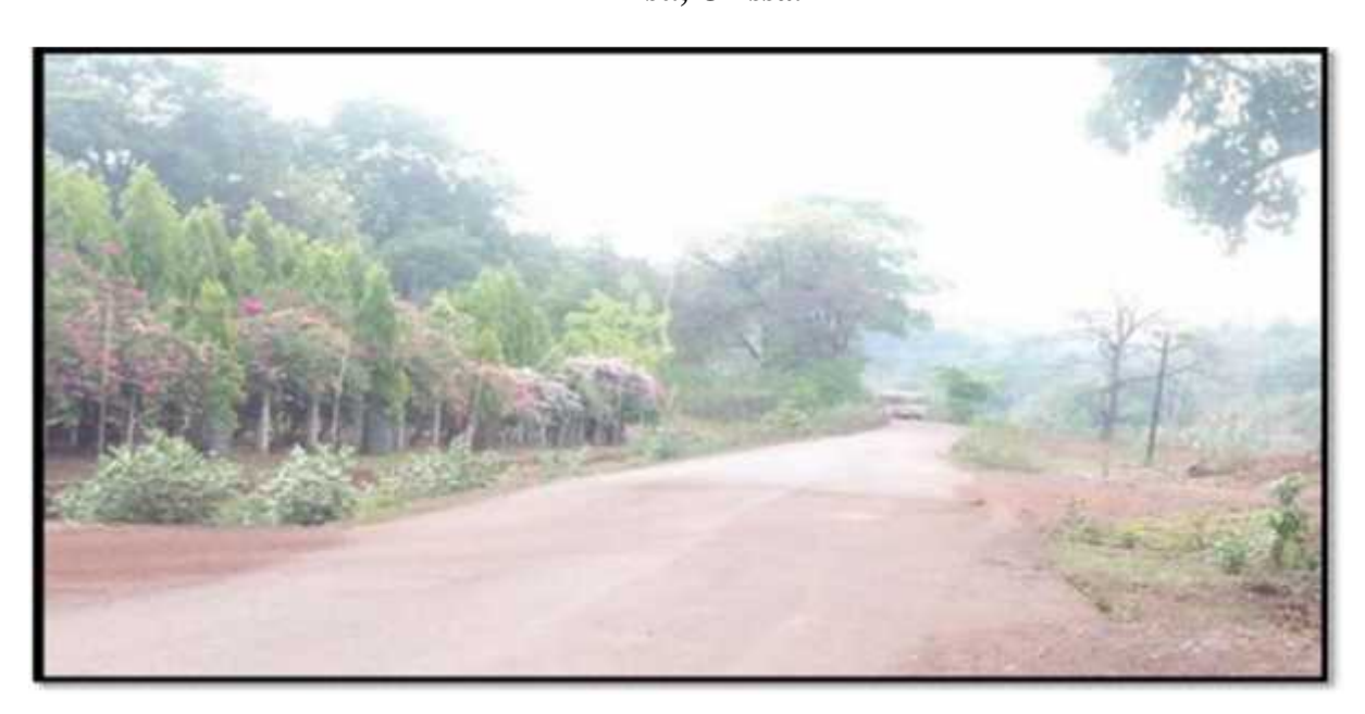
Photo 11 – Showing the black topped road for transportation of minerals

xiii. Fugitive dust generation shall be controlled. Fugitive dust emission shall be regularly monitored at locations of nearest human habitation (including schools and other public amentias located nearest to sources of dust generation as applicable) and records shall be submitted to the SEIAA, Orissa.