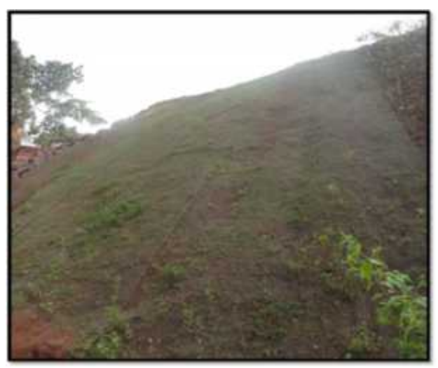
Photo – 2 & 3 – Showing Retaining Wall along with plantations at the toe of dump slopes