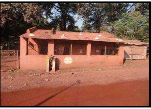
Photo -12 B –Showing the provision of the medical facility for local