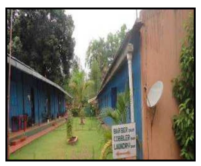
Photo 10 - Shows roof top Rain Water harvesting structure & Recharge Pit